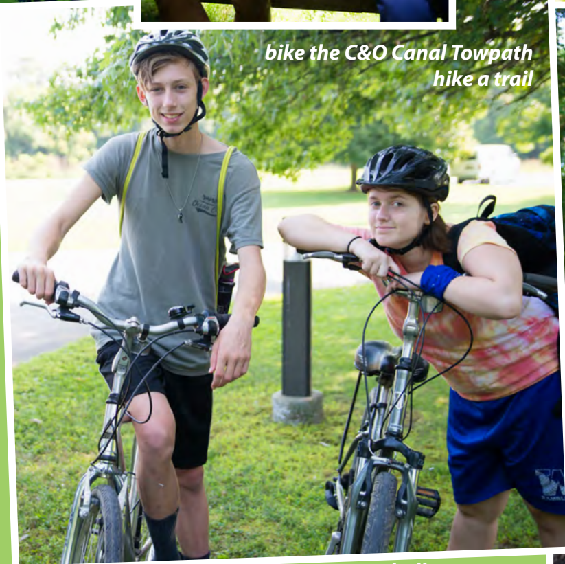
bike the C&O Canal Towpath hike a trail