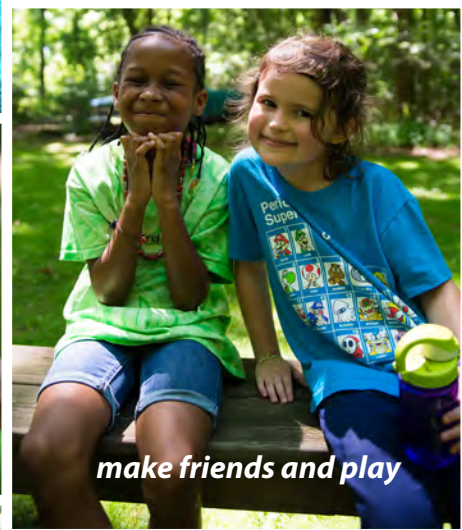
make friends and play