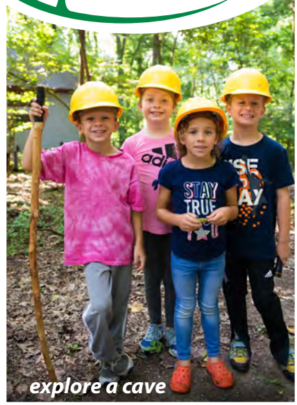
explore a cave