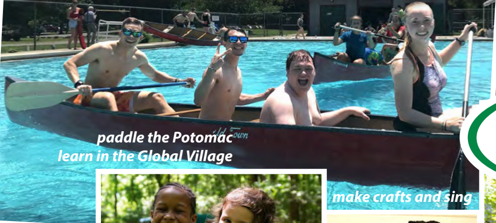
paddle the Potomac learn in the Global Village